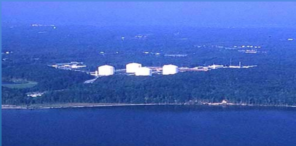
Cove Point, Maryland