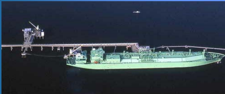
Cove Point, Maryland