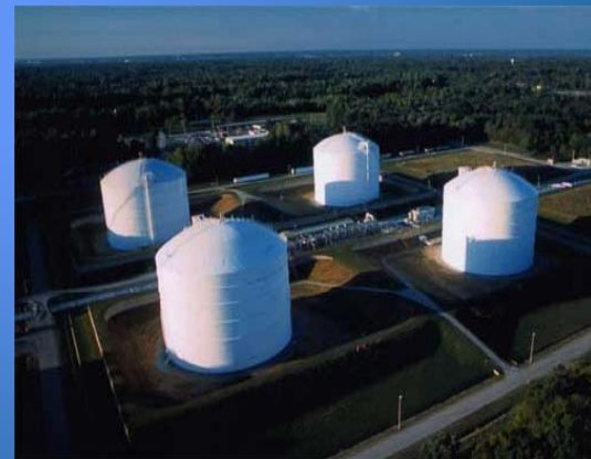
Cove Point Terminal, Maryland